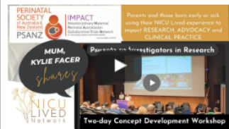
2023 PSANZ - IMPACT's Two-day Concept Development Workshop