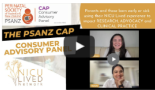
The PSANZ CAP - Consumer Advisory Panel