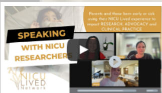
Speaking with NICU Researchers